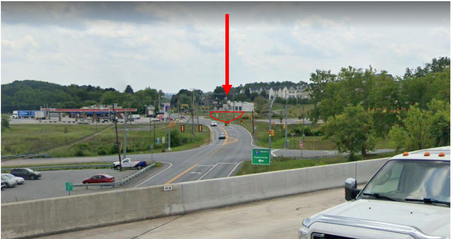
View from I-81