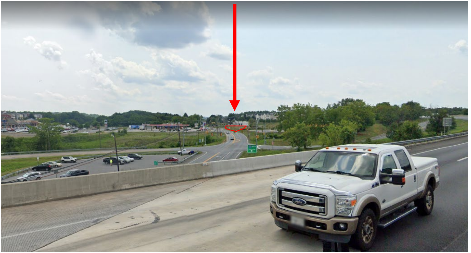
View from I-81